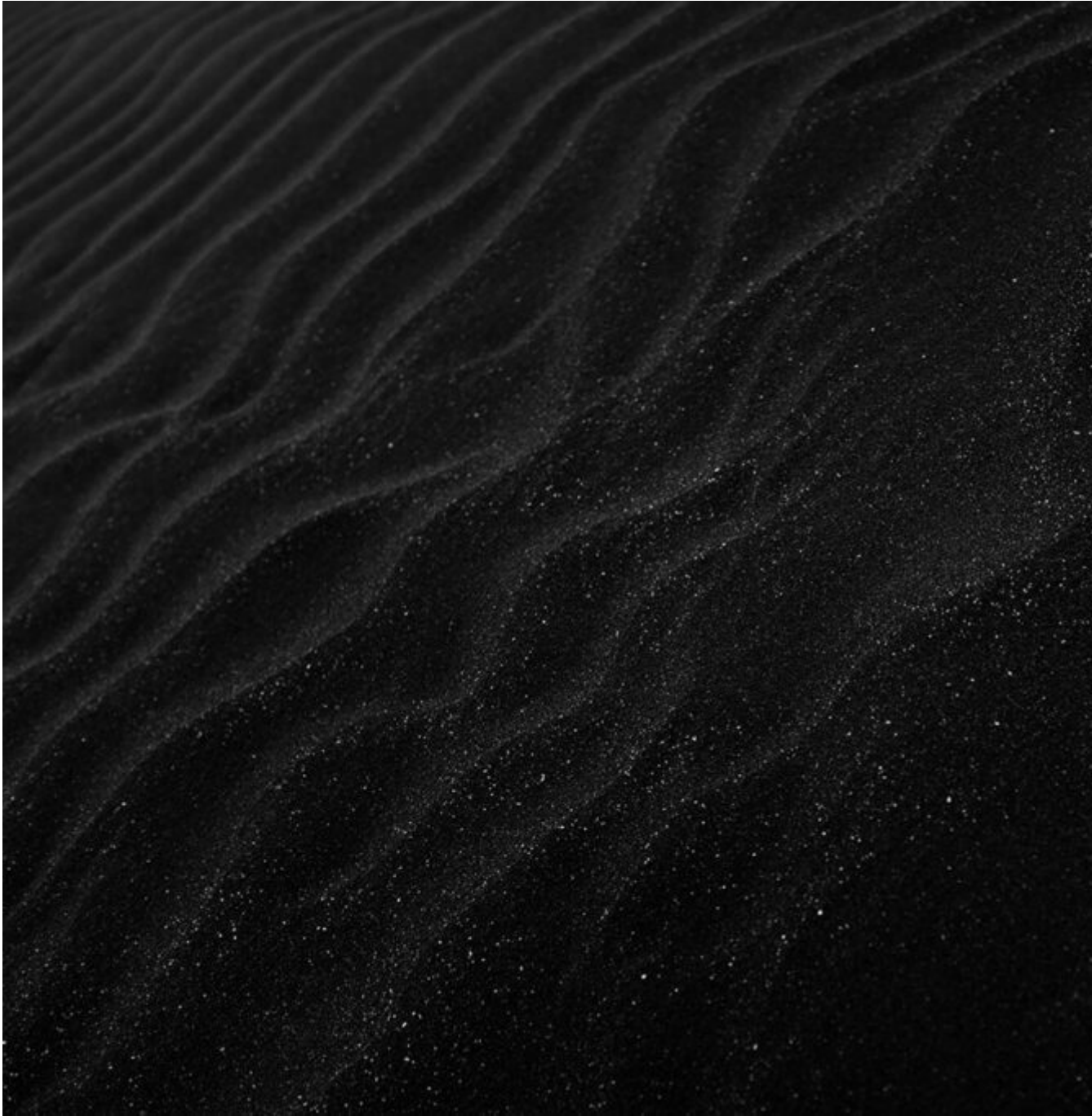
Just another caption